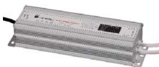
Driver Tira LED 150W IP67 12V