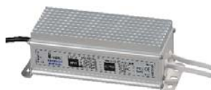
Driver Tira LED 100W IP67 24V