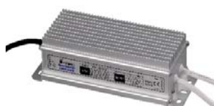
Driver Tira LED 100W IP67 12V