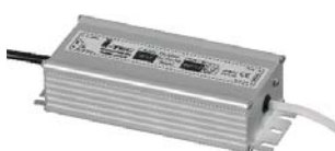
Driver Tira LED 60W IP67 12V