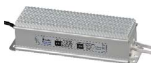
Driver Tira LED 150W IP67 24V