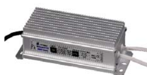
Driver Tira LED 80W IP67 12V